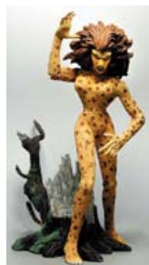
Cheetah $10 (She's shown up in Flash recently. Could always use a few more female villains for the shelf.)