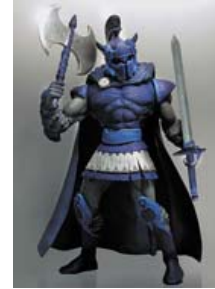
Ares $16 (eh... something has to be last.)