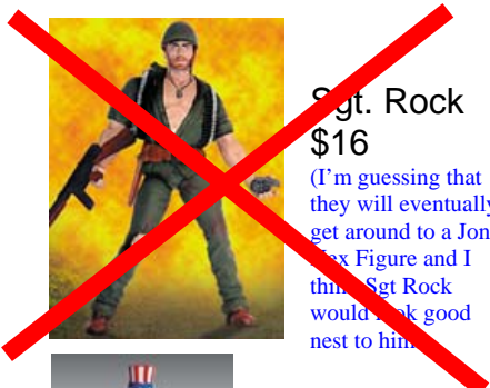
Sgt. Rock $16 (I'm guessing that they will eventually get around to a Jonah Hex Figure and I think Sgt Rock would look good next to him)