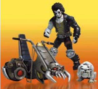
Lobo $45 (You could set him on the shelf next to Wolverine, Nuff said.)